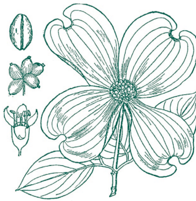
Cornus florida Flowering Dogwood

Cornus alternifolia , Pagoda Dogwood, is a lovely substitute for C. florida . Hardy to zone 4, it may reach a height of 20 feet but usually stays around 12 to 15 feet. Its tiered branching gives an open look to the tree. Unlike the other Cornus species, C. alternifolia 's leaves have a simple elliptical shape and are arranged in an alternating pattern. In fall the leaves are a mix of bright