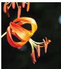
Fig. 2. Individual blossom

There are four members of the lily genus growing naturally in Rhode Island, of which three are native and one, L. lancifolium , is an introduced species. The flowers of these four are sufficiently similar to possibly cause confusion in identification if encountered in isolation and without examining distinguishing features. L. lancifolium , the common Tiger Lily, is distinguished by the simple lanceolate leaves with black bulblets attached in the axilla, where the leaf meets the stem. The three native species have leaves in a distinctive whorled pattern occurring at intervals around a substantial stem creating what Culina refers to as ‘a chain of umbrellas’ up the stem, [Fig 1]. L. philadelphicum , Wood Lily, has a similar flower but it faces upward instead of nodding like the other three. It grows in dryer locations than the others. The flower of L. canadense , Canada Lily, although nodding, is usually yellow.