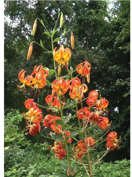
Fig. 1. Mature plant in full bloom—late summer

T urk's Cap Lily, Lilium superbum , is one of most striking Rhode Island native plants, with bright red-orange blossoms atop a six- to eight-foot single stalk. The blossoms are speckled with purple dots and have a distinctive green star in the center. The name is derived from the inverted petals and sepals, three each, which nearly touch in the rear of the flower thrusting the stigma and anthers forward. L. superbum was the subject of Cultivation Note #9 written by Betsy Keiffer in 1991. This Note incorporates much of her original material and expands it somewhat.