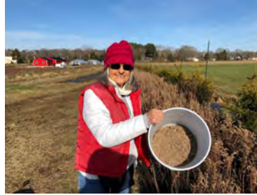
Volunteer of the Year Award Recipients